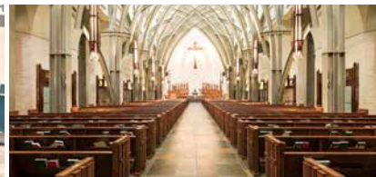
House of Worship